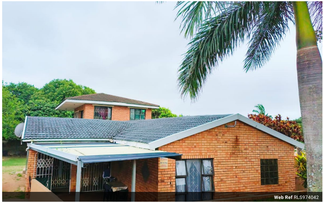
Web Ref RLS974042

Lira Link Rd, Unit 2 Montego Park, Richards Bay Central, Richards Bay, 3900