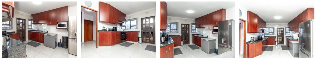
Web Ref RLS976077