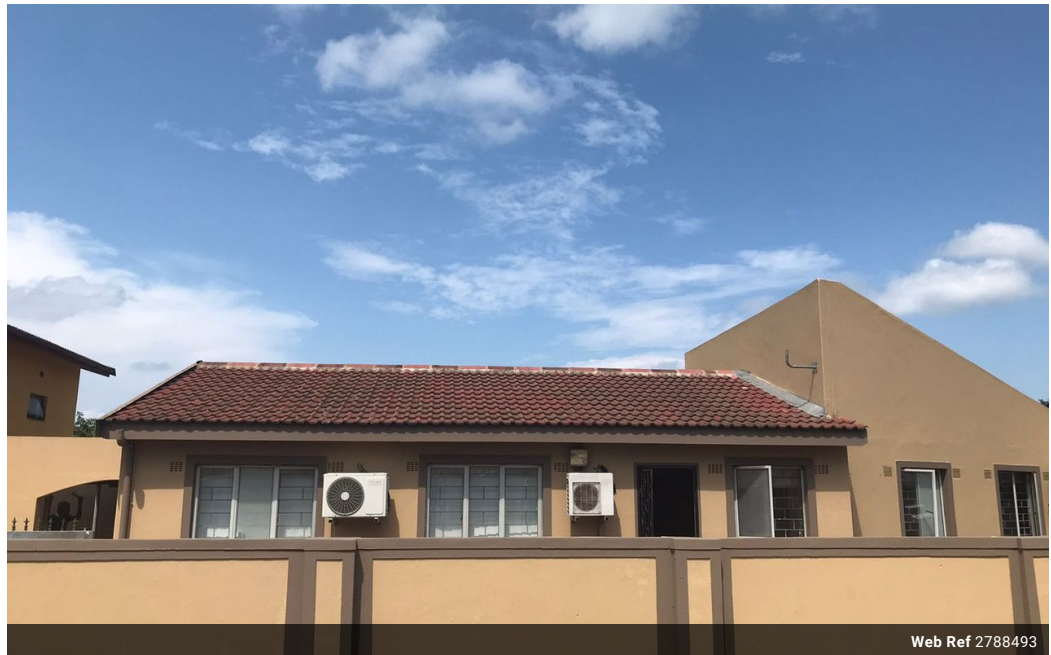
Web Ref 2788493

Lira Link Rd, Unit 2 Montego Park, Richards Bay Central, Richards Bay, 3900