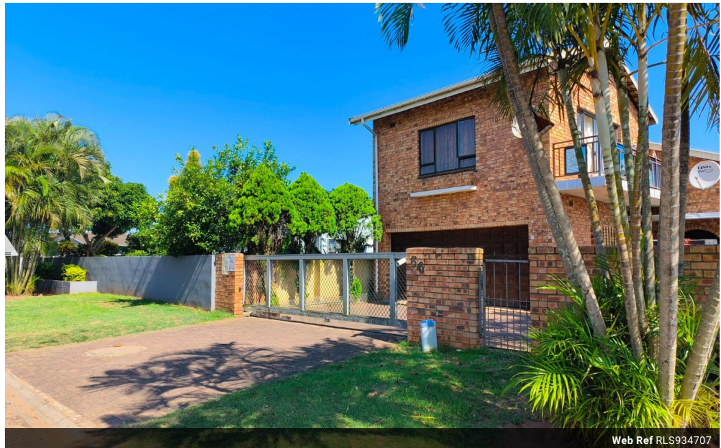
Web Ref RLS934707

Lira Link Rd, Unit 2 Montego Park, Richards Bay Central, Richards Bay, 3900