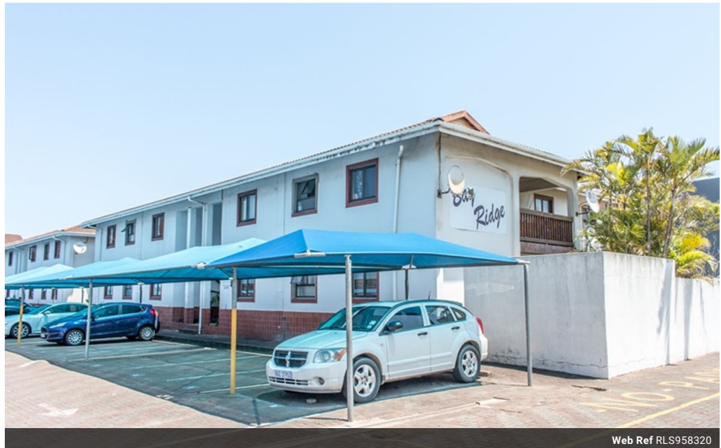
Web Ref RLS958320

Lira Link Rd, Unit 2 Montego Park, Richards Bay Central, Richards Bay, 3900