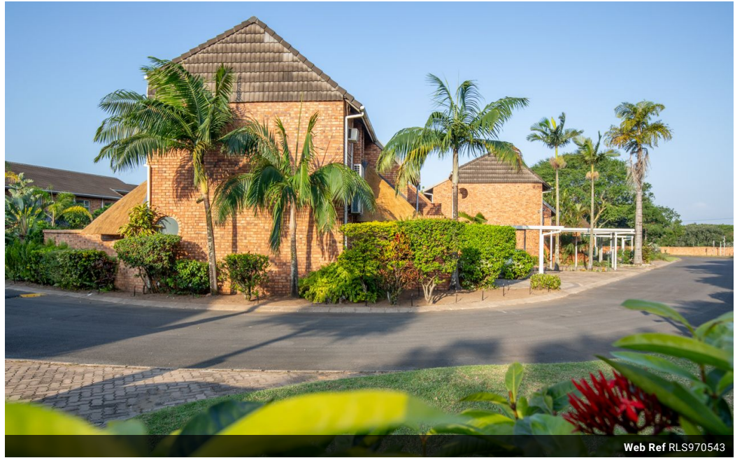
Web Ref RLS970543

Lira Link Rd, Unit 2 Montego Park, Richards Bay Central, Richards Bay, 3900