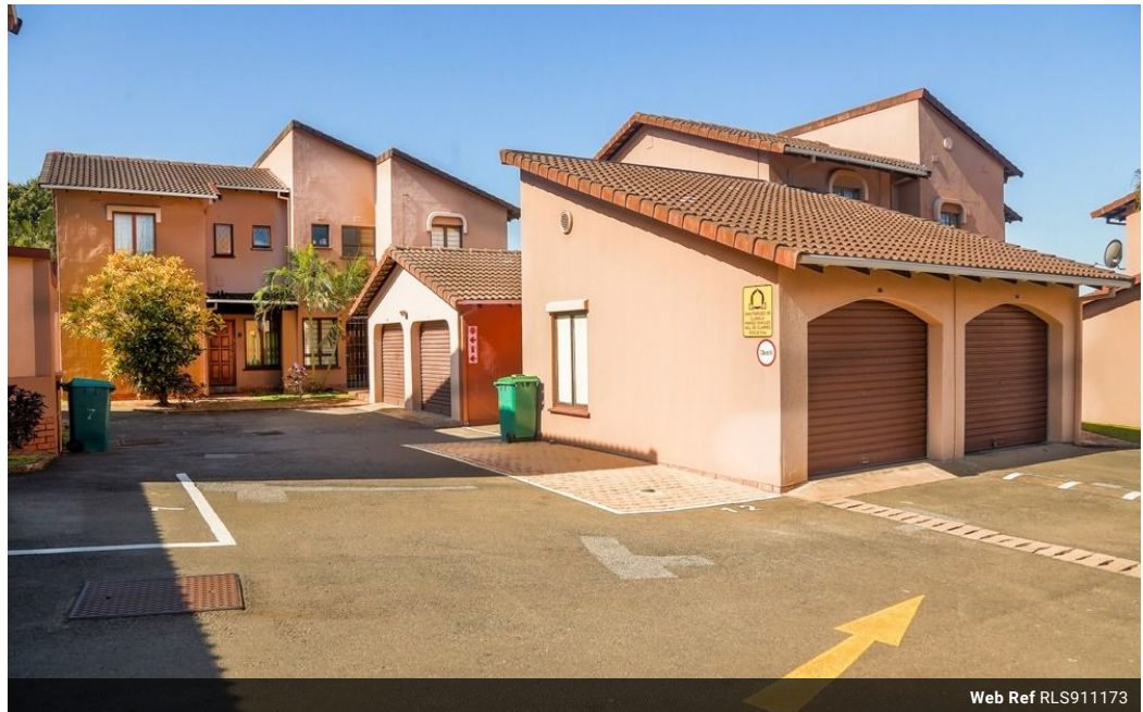
Web Ref RLS911173

Lira Link Rd, Unit 2 Montego Park, Richards Bay Central, Richards Bay, 3900