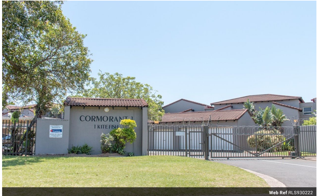
Web Ref RLS930222

Lira Link Rd, Unit 2 Montego Park, Richards Bay Central, Richards Bay, 3900