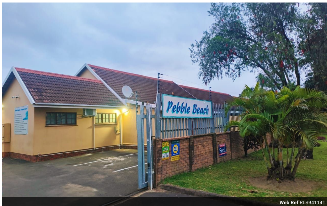
Web Ref RLS941141

Lira Link Rd, Unit 2 Montego Park, Richards Bay Central, Richards Bay, 3900