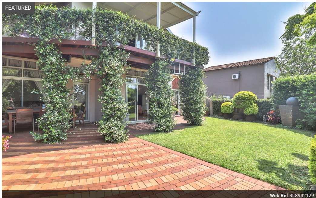
Web Ref RLS942129

Lira Link Rd, Unit 2 Montego Park, Richards Bay Central, Richards Bay, 3900