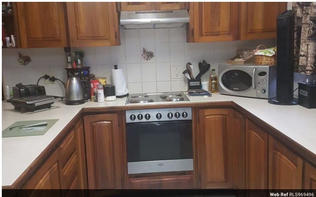
Web Ref RLS969496

Lira Link Rd, Unit 2 Montego Park, Richards Bay Central, Richards Bay, 3900