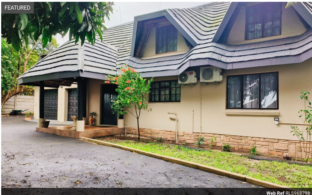
Web Ref RLS968798

Lira Link Rd, Unit 2 Montego Park, Richards Bay Central, Richards Bay, 3900