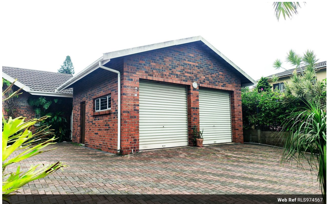
Web Ref RLS974567

Lira Link Rd, Unit 2 Montego Park, Richards Bay Central, Richards Bay, 3900