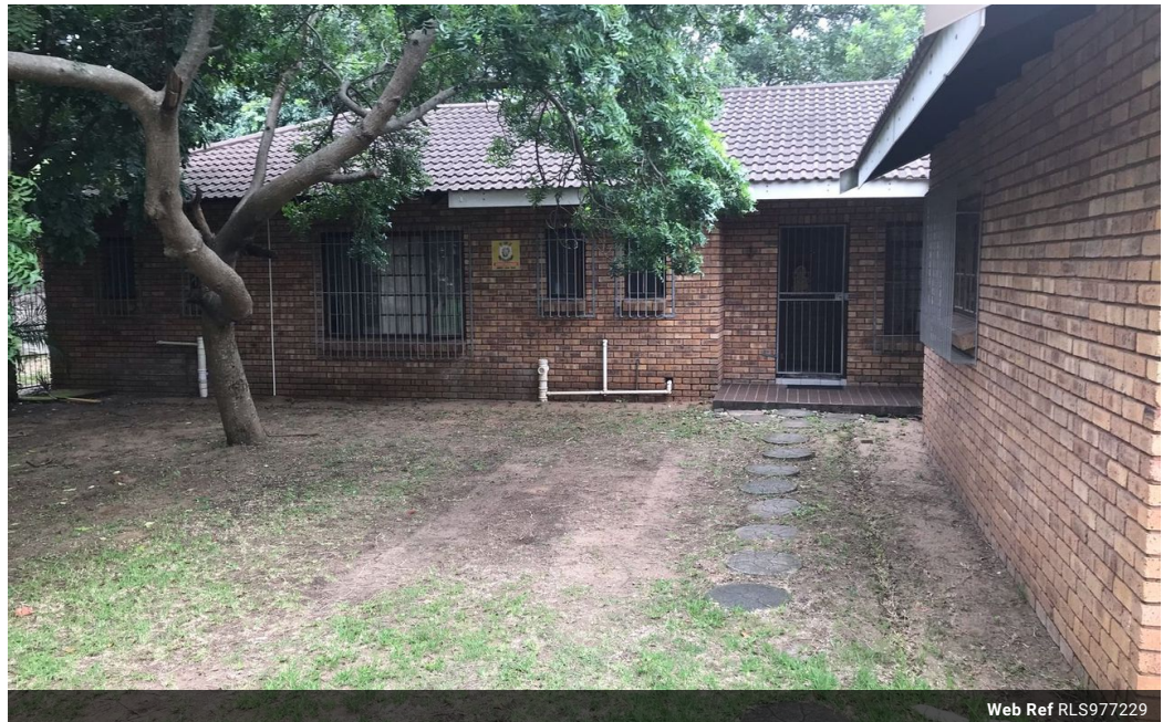
Web Ref RLS977229

Lira Link Rd, Unit 2 Montego Park, Richards Bay Central, Richards Bay, 3900