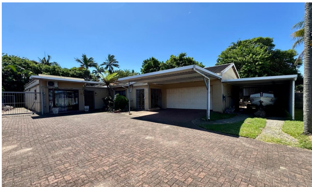
Web Ref RLS978645

Lira Link Rd, Unit 2 Montego Park, Richards Bay Central, Richards Bay, 3900