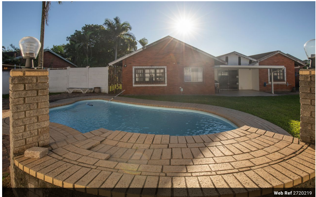
Web Ref 2720219

Lira Link Rd, Unit 2 Montego Park, Richards Bay Central, Richards Bay, 3900