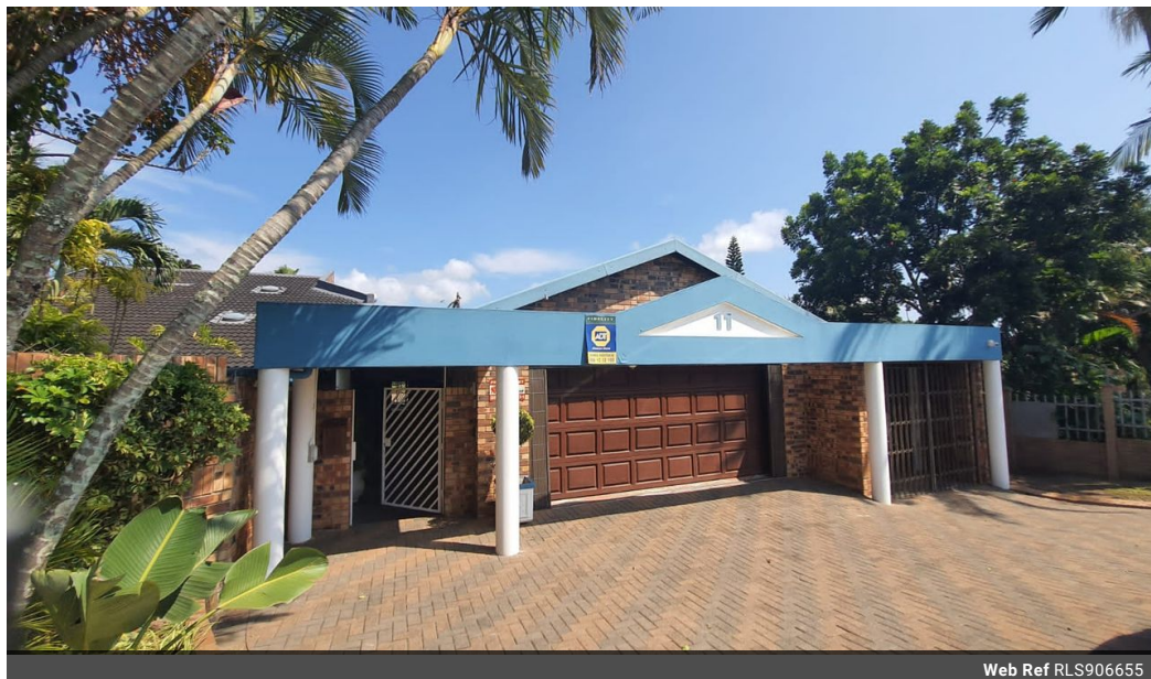
Web Ref RLS906655

Lira Link Rd, Unit 2 Montego Park, Richards Bay Central, Richards Bay, 3900