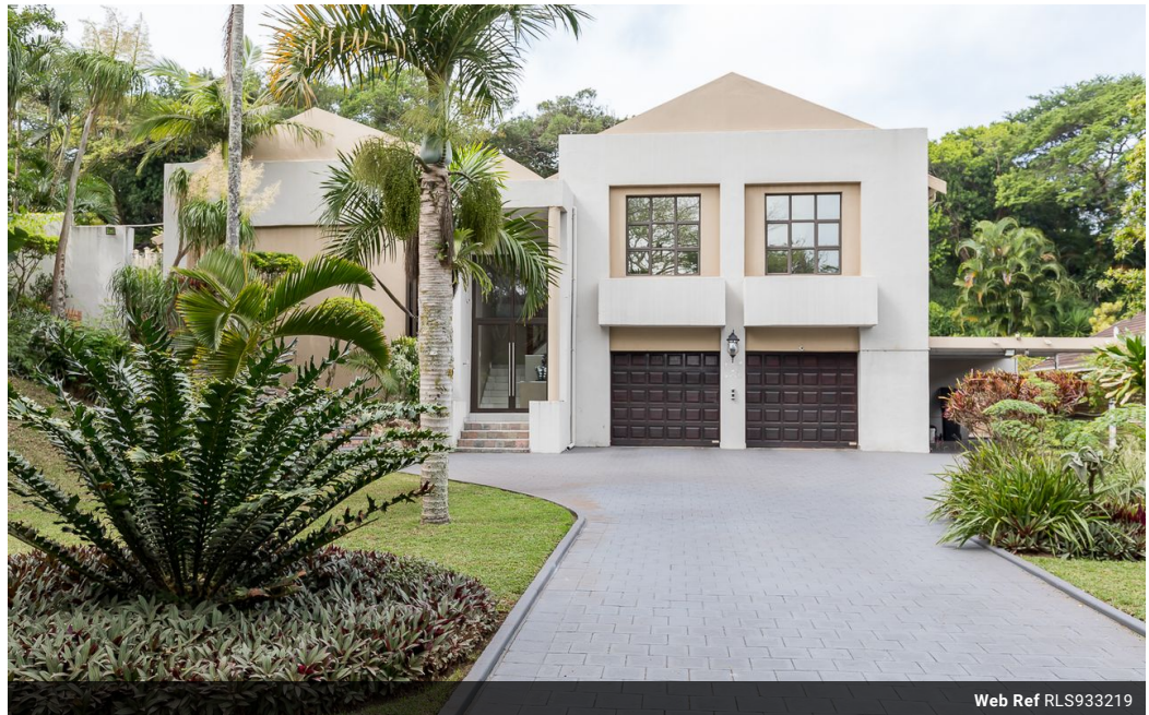
Web Ref RLS933219

Lira Link Rd, Unit 2 Montego Park, Richards Bay Central, Richards Bay, 3900