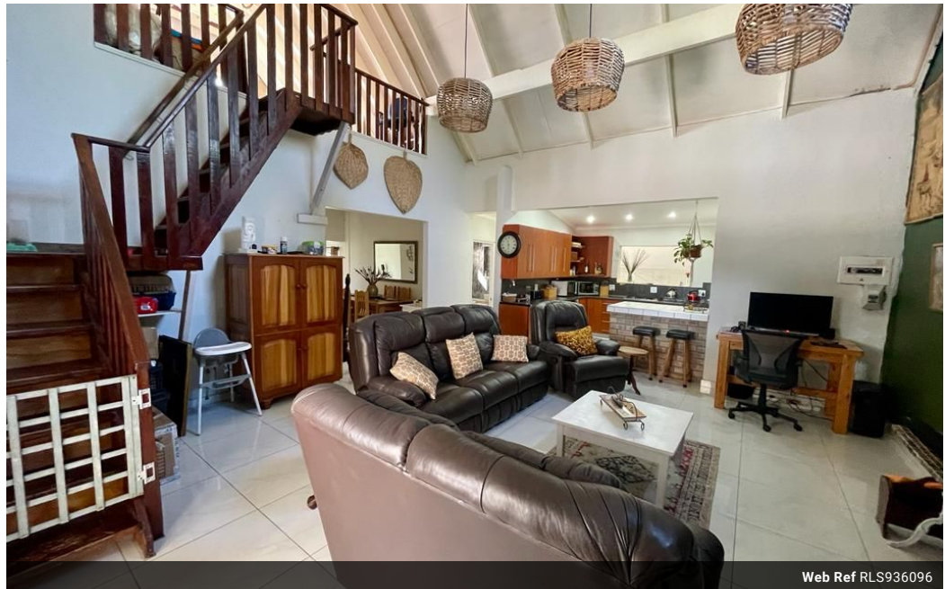
Web Ref RLS936096

Lira Link Rd, Unit 2 Montego Park, Richards Bay Central, Richards Bay, 3900