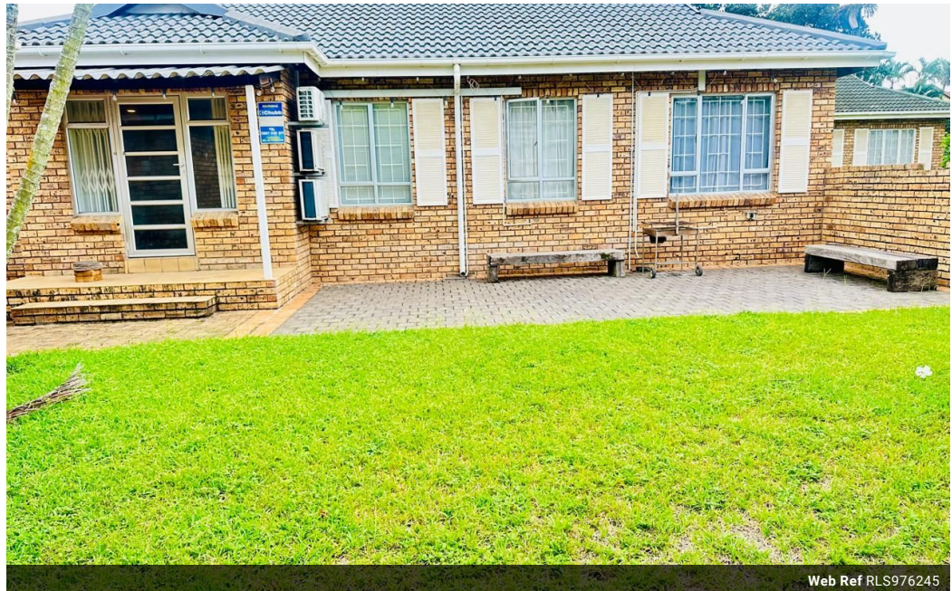
Web Ref RLS976245

Lira Link Rd, Unit 2 Montego Park, Richards Bay Central, Richards Bay, 3900