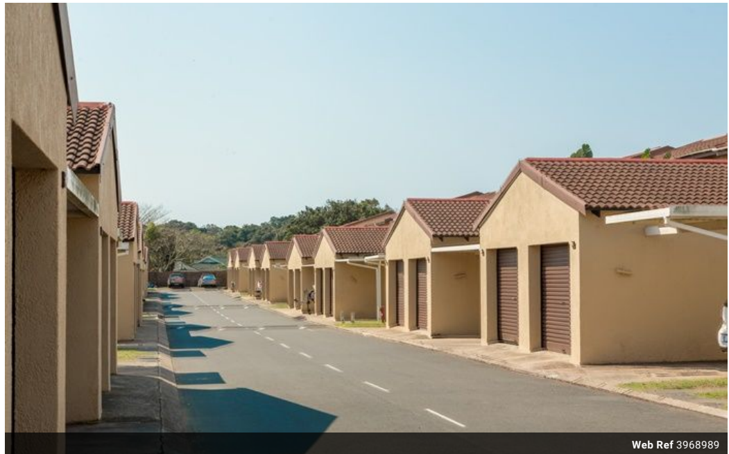
Web Ref 3968989

Lira Link Rd, Unit 2 Montego Park, Richards Bay Central, Richards Bay, 3900