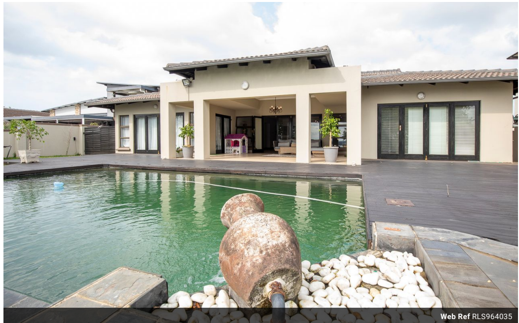
Web Ref RLS964035

Lira Link Rd, Unit 2 Montego Park, Richards Bay Central, Richards Bay, 3900