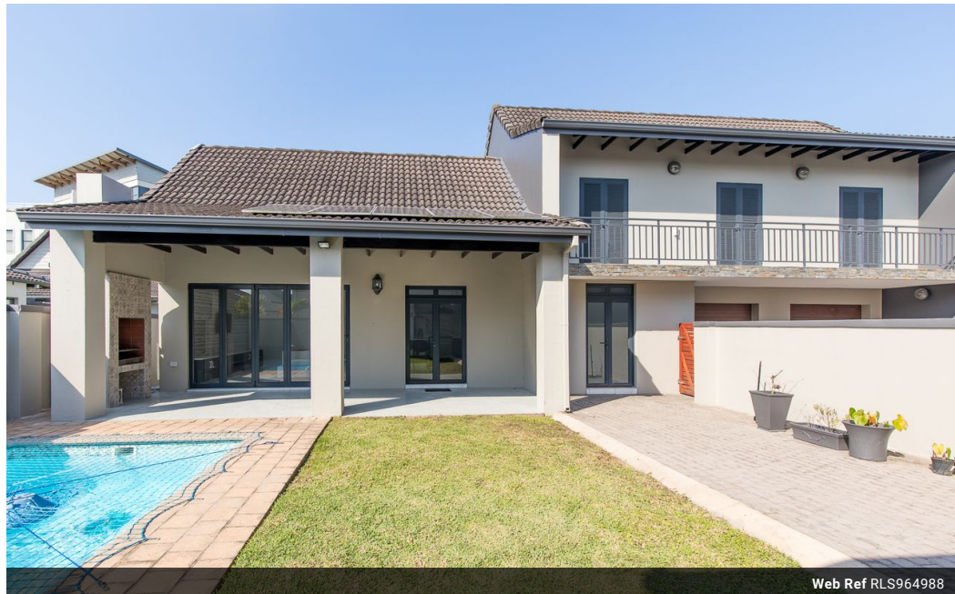
Web Ref RLS964988

Lira Link Rd, Unit 2 Montego Park, Richards Bay Central, Richards Bay, 3900