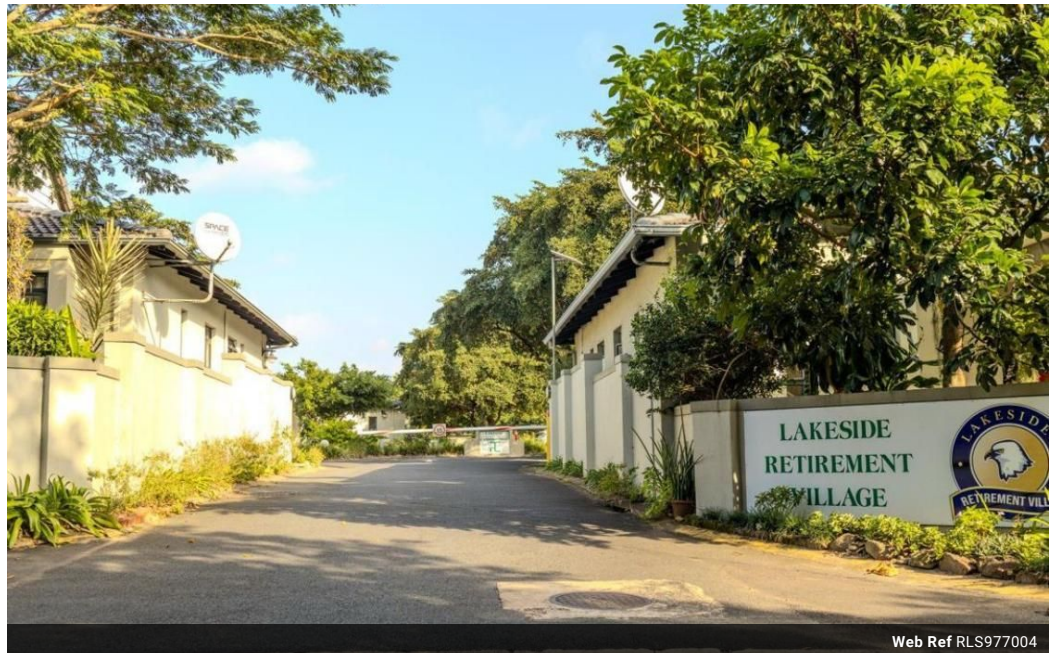
Web Ref RLS977004

Lira Link Rd, Unit 2 Montego Park, Richards Bay Central, Richards Bay, 3900