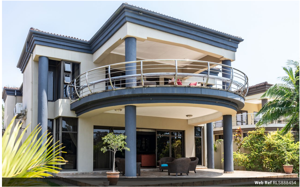
Web Ref RLS888454

Lira Link Rd, Unit 2 Montego Park, Richards Bay Central, Richards Bay, 3900