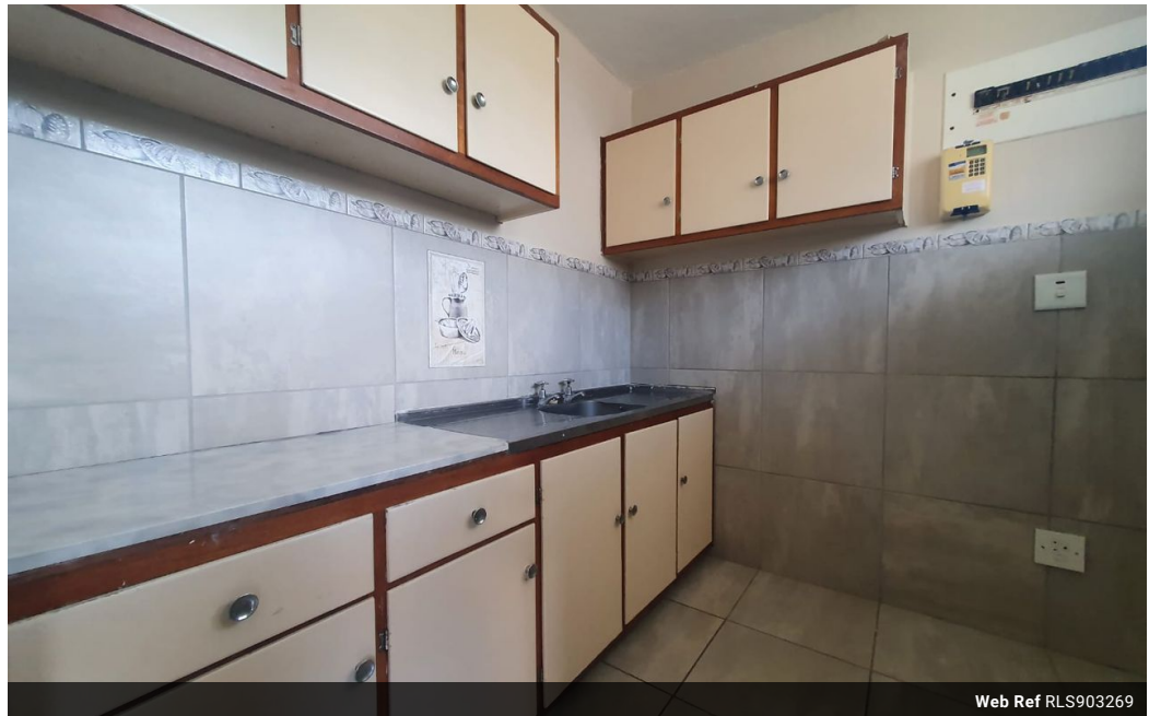
Web Ref RLS903269