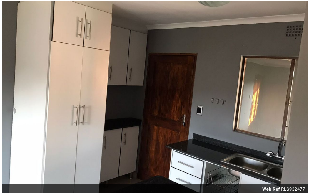
Web Ref RLS932477

Lira Link Rd, Unit 2 Montego Park, Richards Bay Central, Richards Bay, 3900