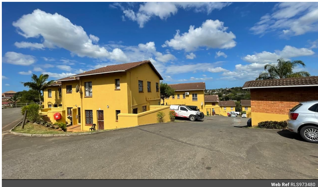
Web Ref RLS973480

Lira Link Rd, Unit 2 Montego Park, Richards Bay Central, Richards Bay, 3900