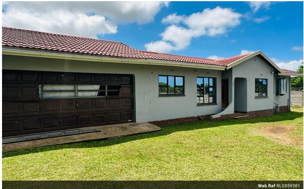
Web Ref RLS959381

Lira Link Rd, Unit 2 Montego Park, Richards Bay Central, Richards Bay, 3900