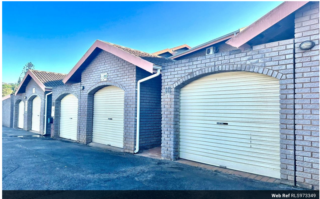
Web Ref RLS973349

Lira Link Rd, Unit 2 Montego Park, Richards Bay Central, Richards Bay, 3900