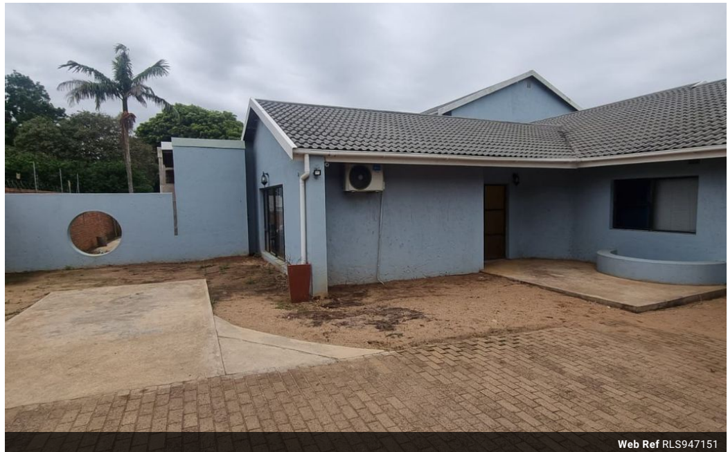
Web Ref RLS947151

Lira Link Rd, Unit 2 Montego Park, Richards Bay Central, Richards Bay, 3900