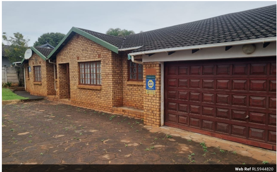
Web Ref RLS944820

Lira Link Rd, Unit 2 Montego Park, Richards Bay Central, Richards Bay, 3900