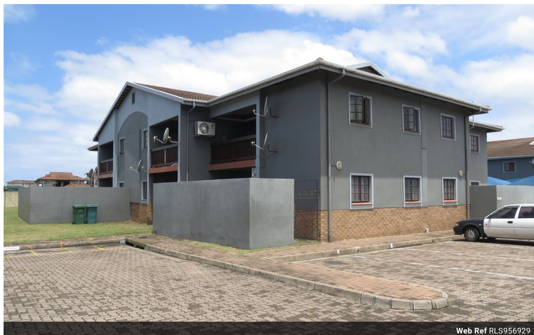
Web Ref RLS956929

Lira Link Rd, Unit 2 Montego Park, Richards Bay Central, Richards Bay, 3900