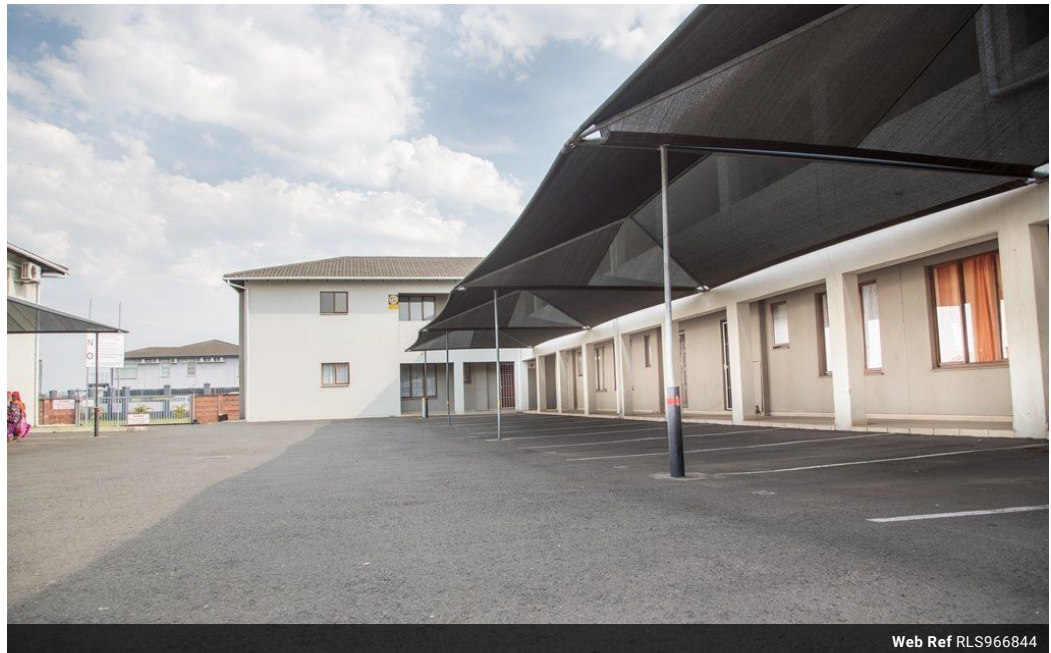
Web Ref RLS966844

Lira Link Rd, Unit 2 Montego Park, Richards Bay Central, Richards Bay, 3900