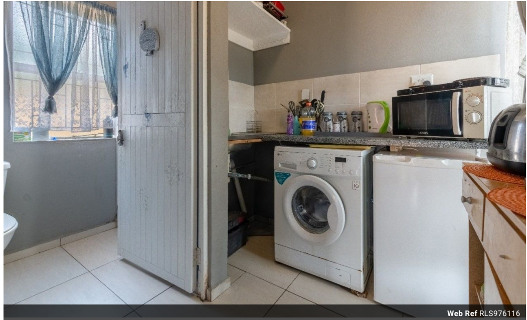
Web Ref RLS976116

Lira Link Rd, Unit 2 Montego Park, Richards Bay Central, Richards Bay, 3900