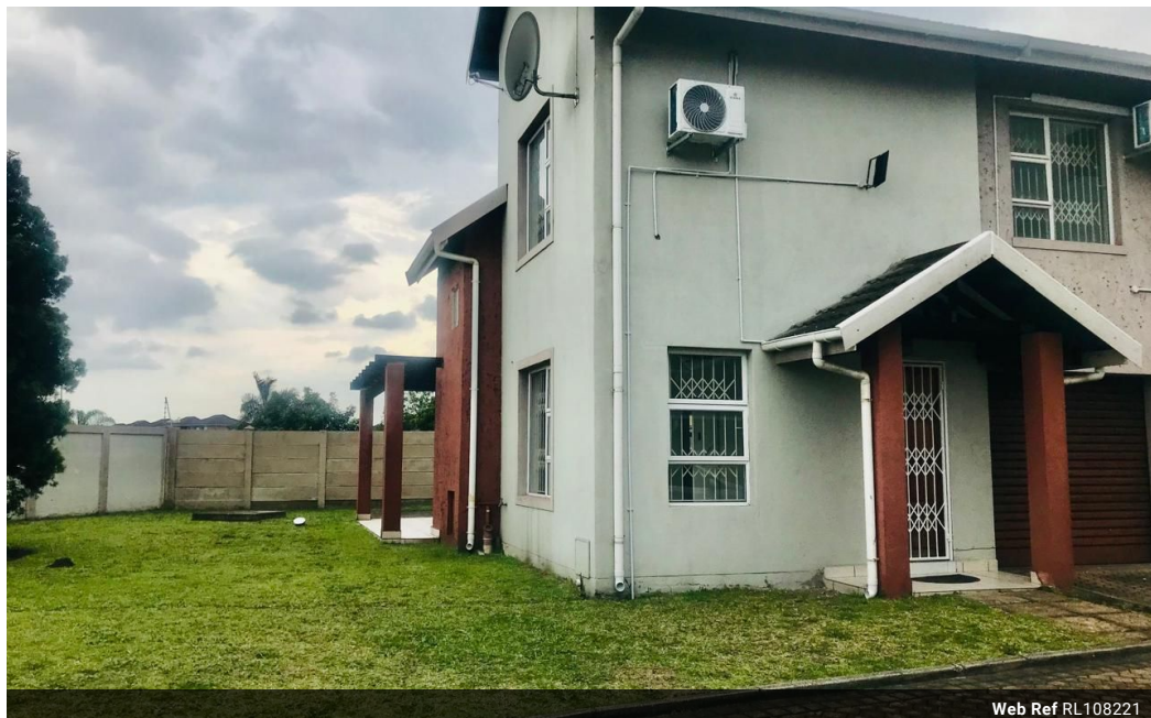
Web Ref RL108221

Lira Link Rd, Unit 2 Montego Park, Richards Bay Central, Richards Bay, 3900