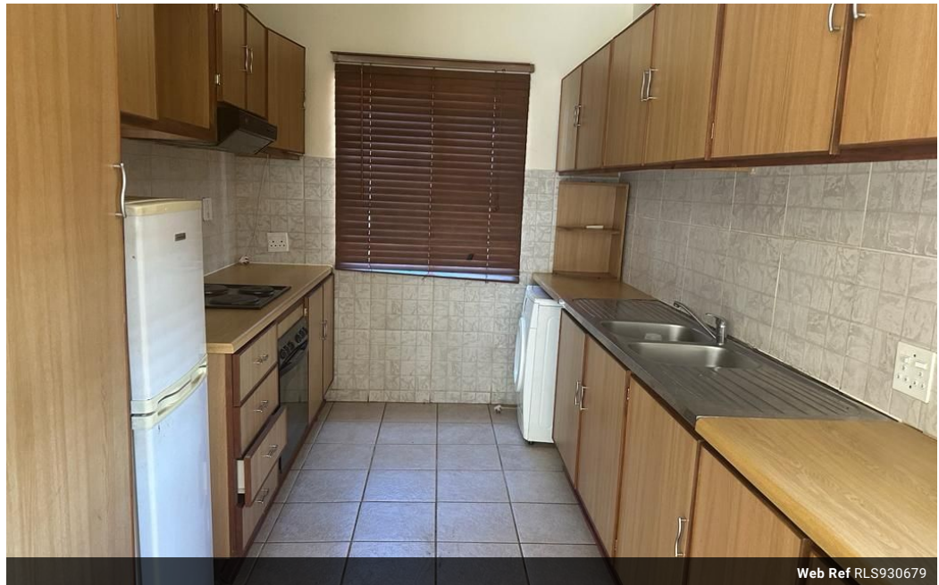
Web Ref RLS930679

Lira Link Rd, Unit 2 Montego Park, Richards Bay Central, Richards Bay, 3900