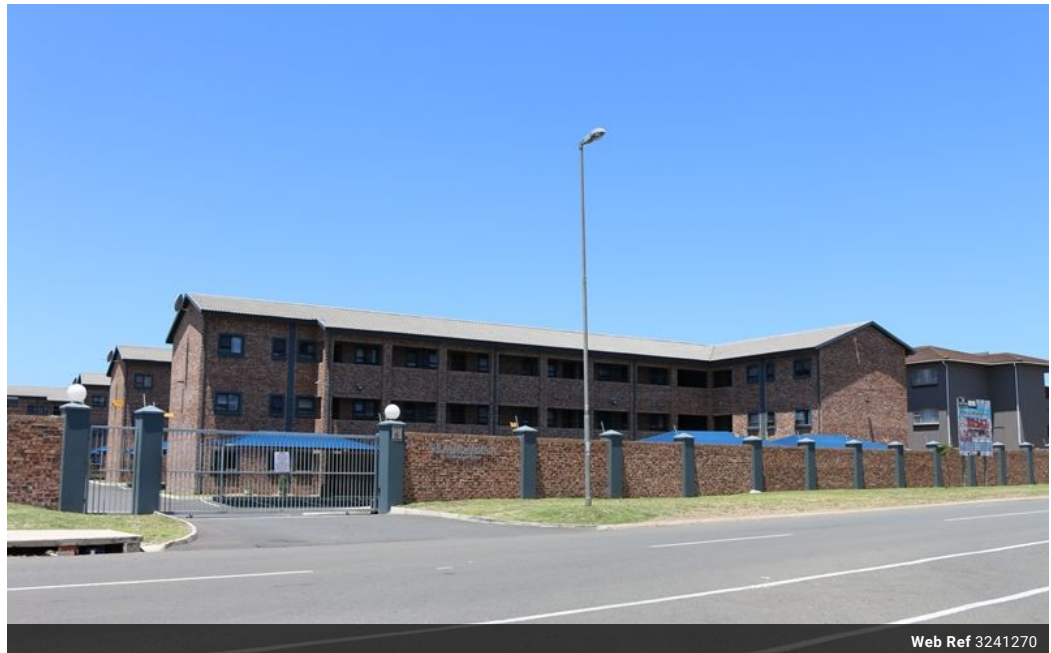
Web Ref 3241270

Lira Link Rd, Unit 2 Montego Park, Richards Bay Central, Richards Bay, 3900