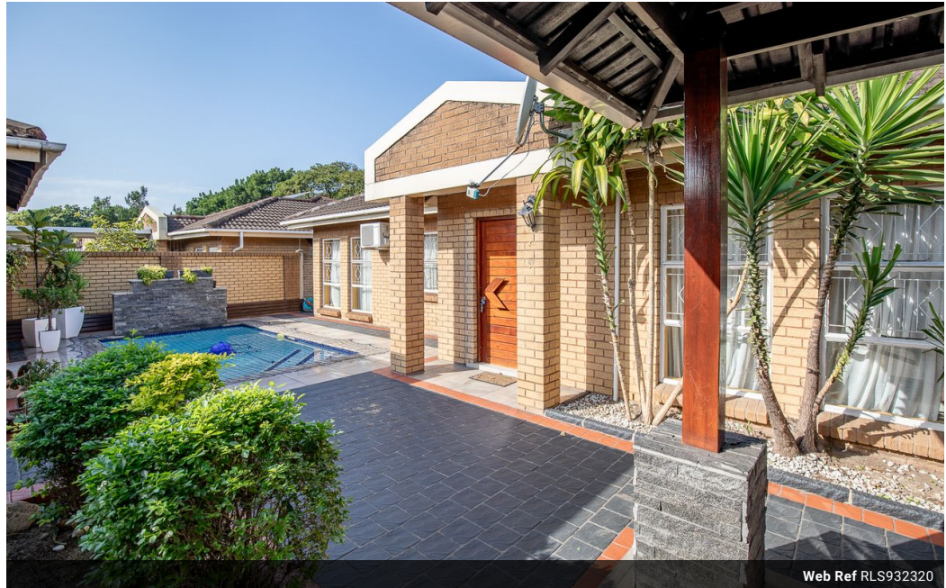
Web Ref RLS932320

Lira Link Rd, Unit 2 Montego Park, Richards Bay Central, Richards Bay, 3900