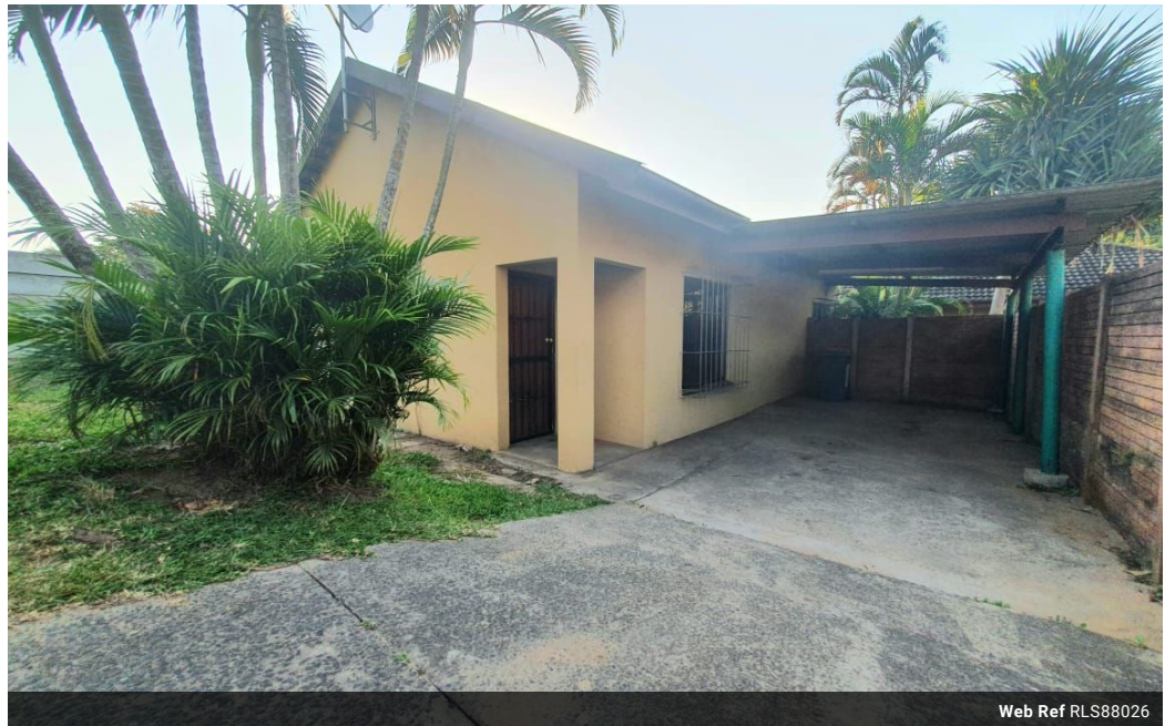
Web Ref RLS88026

Lira Link Rd, Unit 2 Montego Park, Richards Bay Central, Richards Bay, 3900