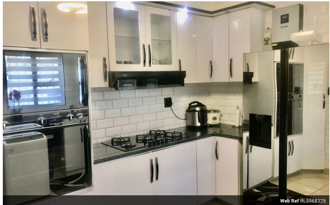
Web Ref RLS968325

Lira Link Rd, Unit 2 Montego Park, Richards Bay Central, Richards Bay, 3900