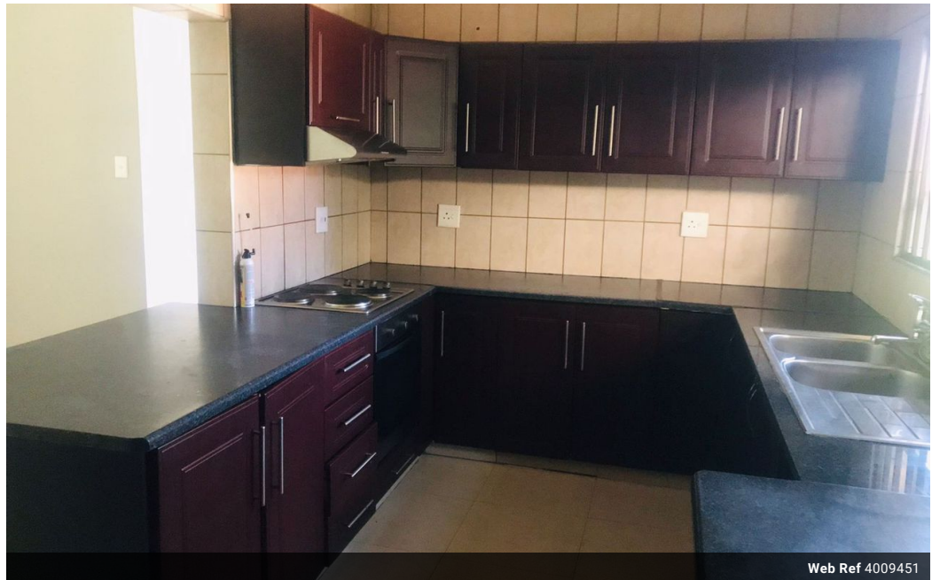
Web Ref 4009451

Lira Link Rd, Unit 2 Montego Park, Richards Bay Central, Richards Bay, 3900