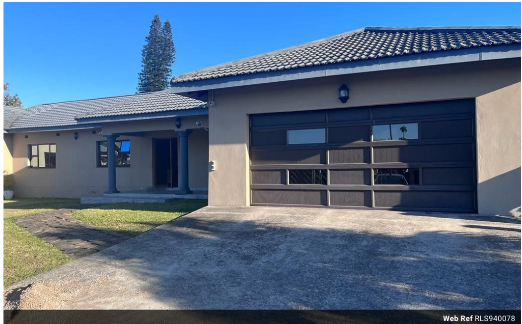
Web Ref RLS940078

Lira Link Rd, Unit 2 Montego Park, Richards Bay Central, Richards Bay, 3900