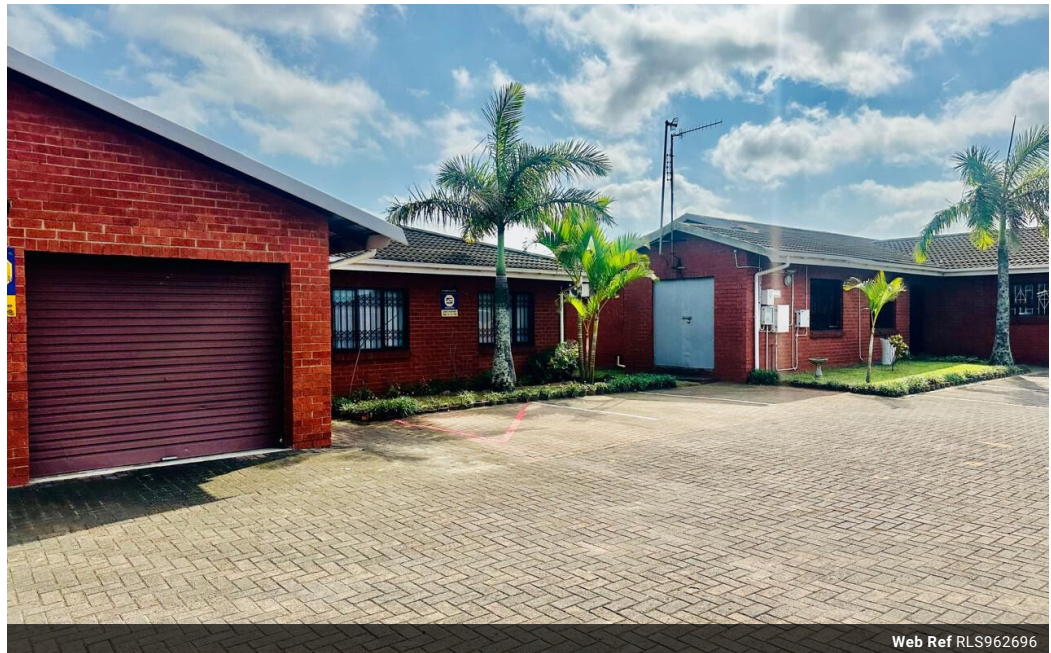
Web Ref RLS962696

Lira Link Rd, Unit 2 Montego Park, Richards Bay Central, Richards Bay, 3900