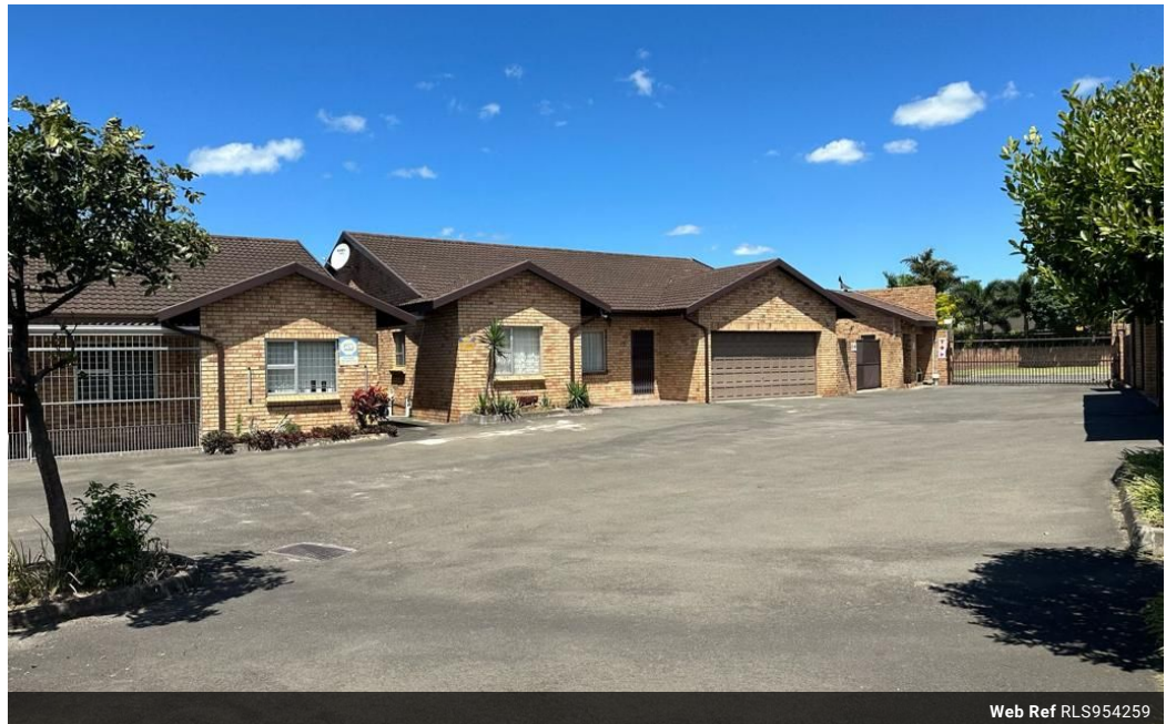
Web Ref RLS954259

Lira Link Rd, Unit 2 Montego Park, Richards Bay Central, Richards Bay, 3900