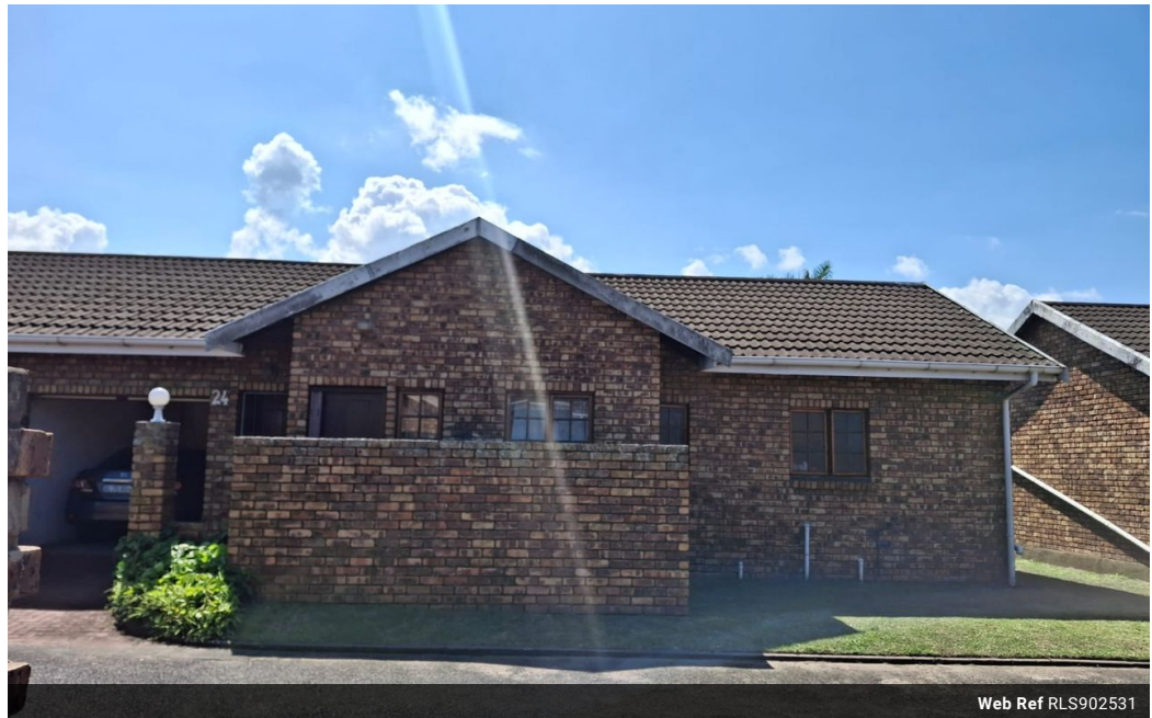
Web Ref RLS902531

Lira Link Rd, Unit 2 Montego Park, Richards Bay Central, Richards Bay, 3900