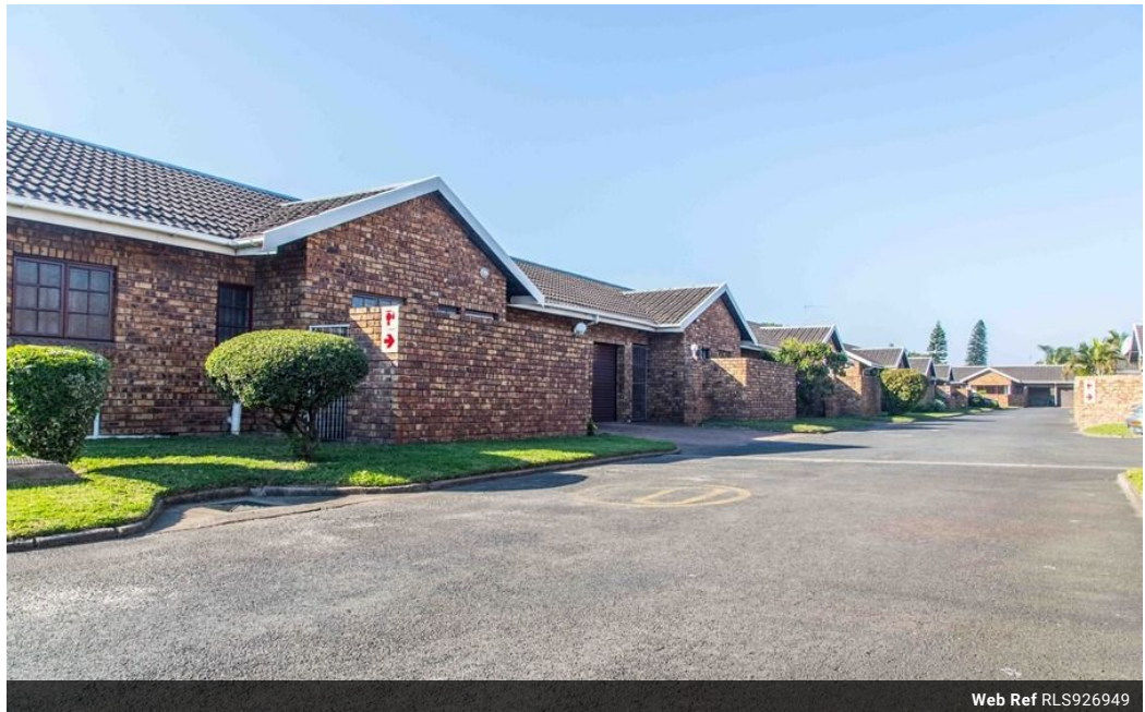
Web Ref RLS926949