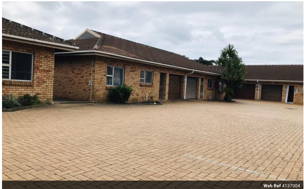
Web Ref 4137004

Lira Link Rd, Unit 2 Montego Park, Richards Bay Central, Richards Bay, 3900