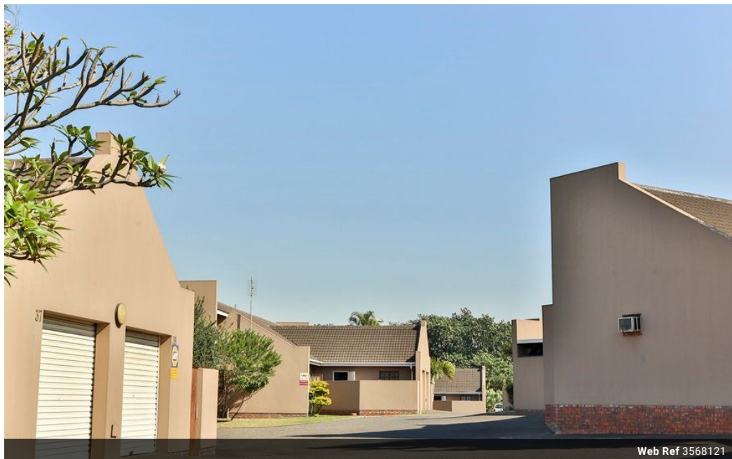
Web Ref 3568121

Lira Link Rd, Unit 2 Montego Park, Richards Bay Central, Richards Bay, 3900