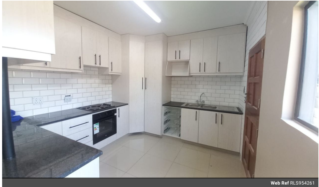
Web Ref RLS954261

Lira Link Rd, Unit 2 Montego Park, Richards Bay Central, Richards Bay, 3900